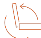
Adjustable signal direction