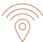
Extend flight range