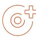
Improved video signal