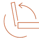
Adjustable signal direction