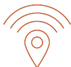
Extender Flight Range