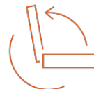
Adjustable signal direction