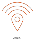
Extended Flight Range