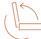
Adjustable signal direction